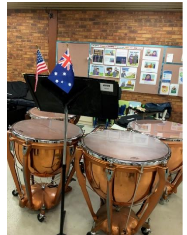
Leaving our mark in Oz