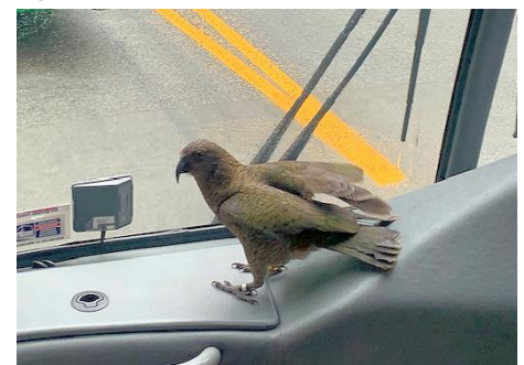
Our kea buddy

After the performances, the band became a sightseeing group touring Australia and New Zealand. We took the train to Glenelg Beach in Adelaide, were entertained by the "little penguins" at Phillip Island, cruised Sydney Harbour, admired the waterfalls and scenery in Milford Sound, and generally had a fine time. We even met a cheeky kea 5 who dropped into our motor coach for an up-close-and-personal visit.