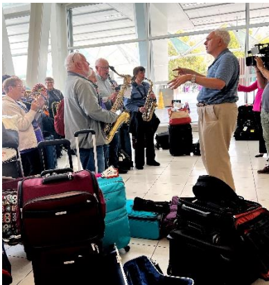
News coverage of arrival in Adelaide