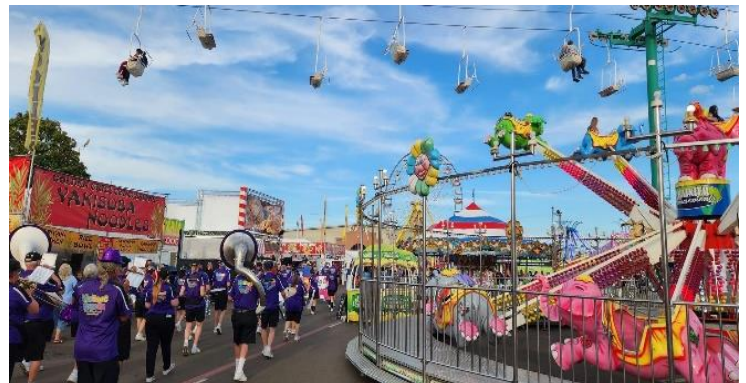
One of our State Fair mini-parades