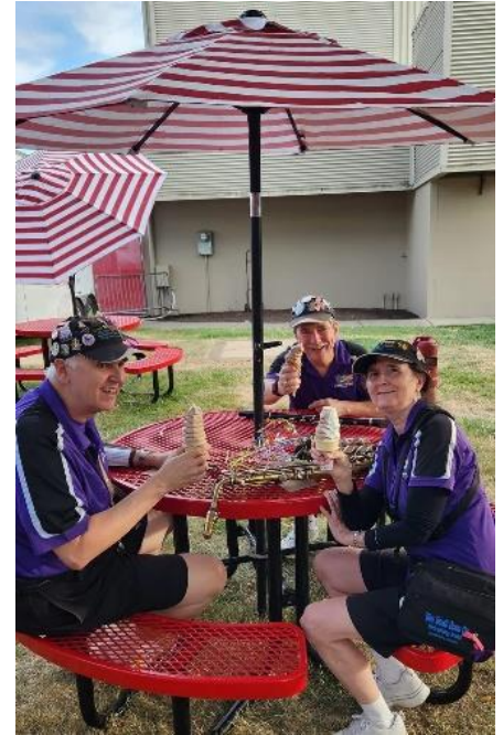
Healthy State Fair snacking

cluded a visit to the Oregon Dairywomen's booth for ice cream after the 6pm parade. In past years we drove back and forth to Salem every day, but this year we tried renting an apartment through VRBO. Cutting the daily drive time from 2 hours to 10 minutes proved to be a swell idea.