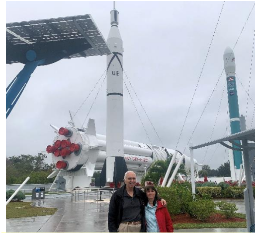
Kennedy Space Center Rocket Garden

brother, and their comes-withs. This was our first visit to family since the ‘rona hit and it felt good to see everyone in person. We even got treated to a Kennedy Space Center visit.