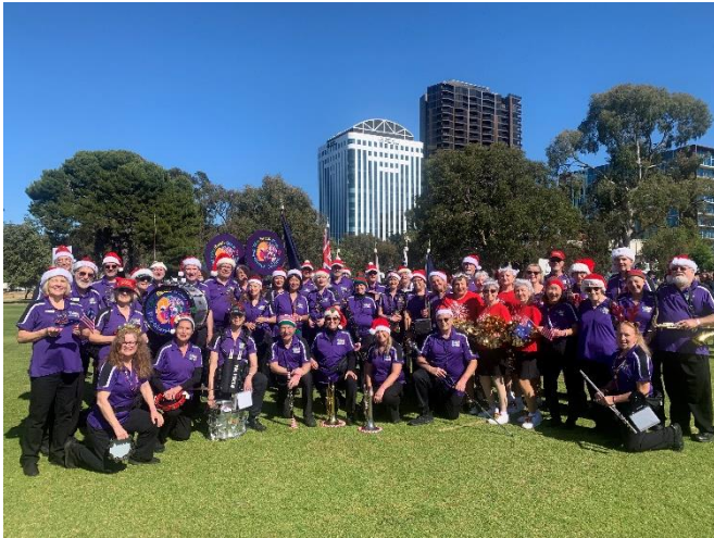
In the staging area in Adelaide

Way back in 2020, TBGO began planning its most ambitious adventure, but thanks to a certain global pandemic we had to put it on hold. We fi-