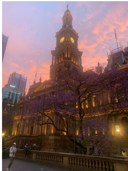
Sydney Town Hall at sunset – unretouched!

Second Wind Jazz had success rebuilding this past year after losing personnel during the previous few years. We added some fun players to the group and hope we can keep them. And we’re gigging again, with performances at a local winery and for a retirement community this summer. The band also performed for a celebration of