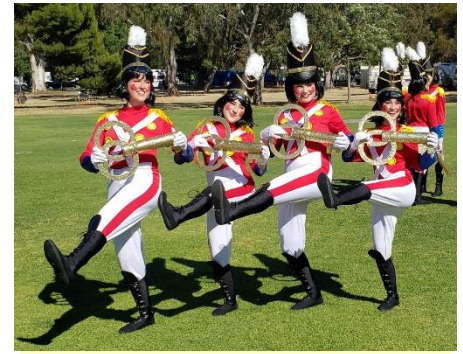
Some of the elaborate Pageant costumes

streets and the parade was awesome! We were only a few entries in front of the float with Father Christmas. As we neared the end of the parade, confetti shot out in anticipation of Father Christmas's arrival. It was way cool to be marching and playing with a confetti blizzard swirling all around us.