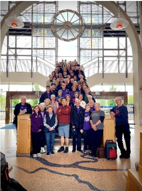
Everett Amtrak station

the July 4 th St. Paul Rodeo Parade, a birthday celebration for an 80's-music-loving four-year-old whose previous birthdays had all been low-key since they fell during the pandemic, and trade show performances at the Oregon Convention Center for the Oregon Dental Association and Oregon Association of Nurseries. 2