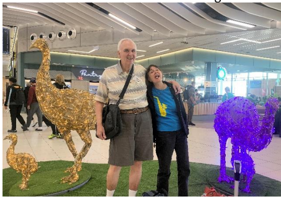
Holiday fun in the Adelaide airport