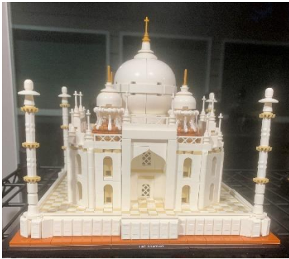
Our own little mausoleum

We're not as fond of this one as the others. It gets a little strange or maybe a lot strange with weird plots and actors whispering a lot... We've also been watching The West Wing . It's amazing how many of the issues on that show are still issues today.