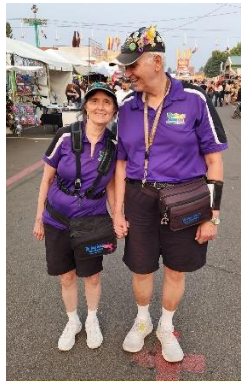
Ain't we adorable?