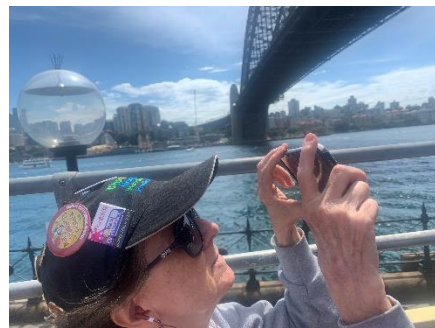
Sydney Harbour Bridge

When the band travels, we like to play something from the area we're visiting. For this trip we decided on "Back in Black" by the Australia band AC/DC to complement our holiday tunes. 4 On parade day 300,000 people lined the