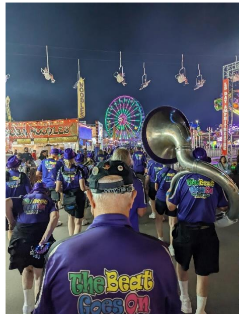
We gotta go now