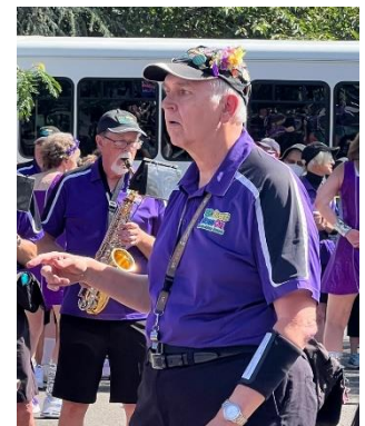
Quarterbacking the band

After missing a couple of years, TBGO was back at the Oregon State Fair in Salem for all 11 days of the Fair. It's long days and a lot of driving, but on the plus side we get to visit the Oregon Dairywomen's booth for an ice cream fix every night between shows. 6 We figured the odds of anyone in the band catching Covid were low since the Fair is all outdoors, but we still feel a bit lucky to have made it out of that petri dish of humanity unscathed.