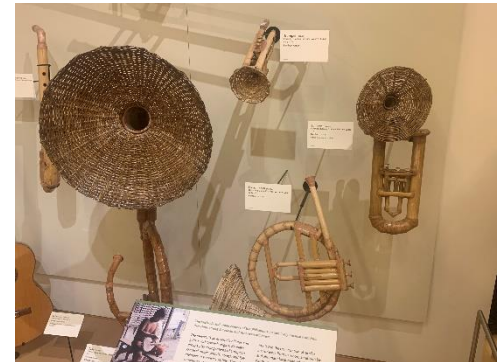
Yep, they're really all oversized kazoos

expensive – all with kazoo mouthpieces! Most exhibits are hands-off, but there's also a hands-on gallery where we played a gamelan 8 and a theremin. 9 After we visited the museum, we headed to In-n-Out-Burger for lunch—yum! We were hungry and the burgers and fries were great.