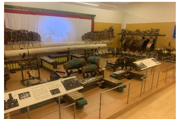
A gamelan orchestra

traipsed 11 over to the Council Chambers at Portland City Hall where we played a couple of tunes for the swearing-in of Portland