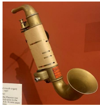
Anyone can play the Playasax

to modern times and exhibits from every continent. If you can blow into it, bang on it, or otherwise make a sound with it, you'll find it in the MIM. One favorite exhibit was a "saxophone" with a player-piano roll.