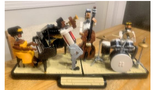
We be jamming!

already had a 16" diameter Lego Death Star and a replica of the first moon landing, we added a wire display shelf and now have our own miniature Legoland on the back porch. We couldn't be prouder.