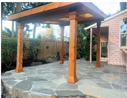
It's almost complete!

After all our backyard summer hang-outing we decided it would be great to have a patio cover, so in August we hired a company to build it. In the process of digging the postholes for the structure, they found that there was a gap between the bottom of the patio and the ground underneath.