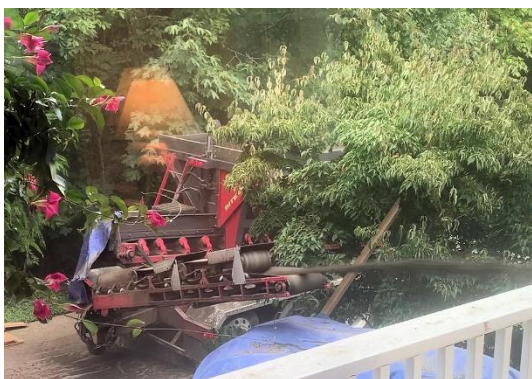
World-class gravel shooting. Check out the video for full amazement.

Sooo, that job got twice as big and—you guessed it—twice as expensive. Between scheduling delays and weather delays, it's still not quite done ... although the space heaters might arrive this week. 14