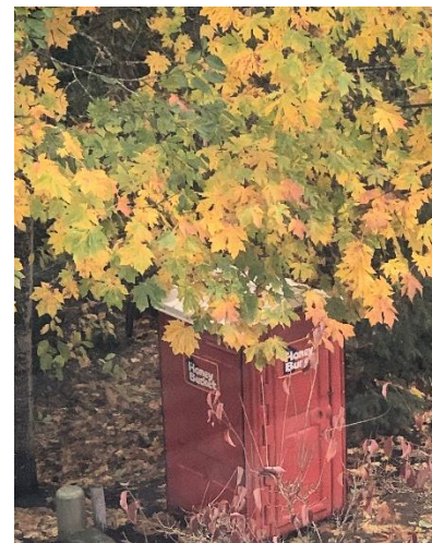
Patio construction bonus: our own TARDIS

Both TBGO and Portland Community Wind Band have been doing virtual music projects. While these projects are no substitute for in-person rehearsals and performances, they're still fun and give everyone a reason to keep playing. Each musician records his/her part while listening to a click track and sends it to the director for editing and assembly. We've learned that recording can be frustrating because it seems like there's always some dopey mistake in each take. At some point, you just pick the best one, send it along, and pretend it was perfect.