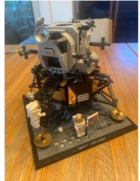
The Eagle has landed

The mini-fig astronauts are darling and it beautifully complements our 16" diameter LEGO Death Star.