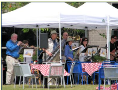
Treble in River City plays the Country Fair