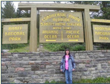
Continental Divide between Banff and Kootenai National Parks

pigging out in the restaurant we hiked round the lake and even spent an afternoon canoeing. 13 Other days we checked out the visitor center to