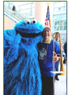
Yet another celebrity

nice little conversation, reported here in its entirety. 8 Quincy was selected as grand marshal because he produced the album and video for the song to be played in the parade. You may have heard of it ... Thriller!