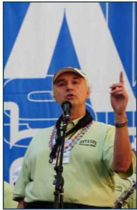
Running the stage show at NAMM

Later in the afternoon we got a coveted slot on the Courtyard Performance Stage. Despite having what was probably the largest group at the show, 9 everything went smoothly and we knocked 'em dead. That left the next couple days to wander the show floor and (best of all) try out every top-end saxophone and clarinet in the joint. Ah, heaven!