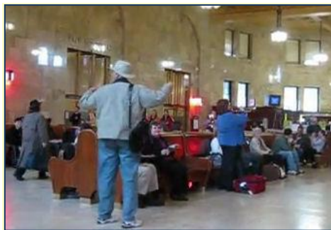
Flash band at Union Station

Have you heard of flash mobs? 20 A flash mob is an event where one person begins singing or dancing in an unexpected venue and gradually others join in till there's an entire ensemble performing. In November, we played America the Beautiful with a flash band at Union Station in downtown Portland. It was about the most fun we could have in less than 5 minutes! In the vid-