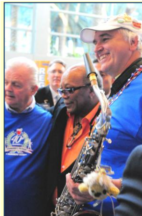
The inimitable Quincy Jones