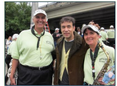
Portlandia and Saturday Night Live's Fred Armisen

Also in August, GAL was invited to take part in a TV shoot for a show called Portlandia . The show features Portland and its quiriness and has just hit the air in January 2011. We had to sign releases saying we wouldn't talk