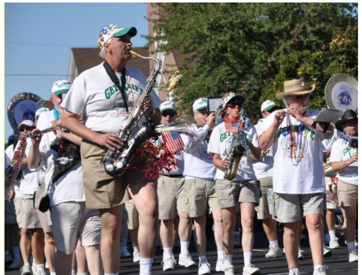
We're outa here!