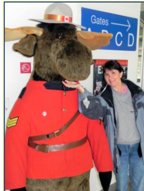
Making friends at Icefield Centre