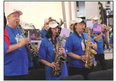
Rehearsing with the Petiot Band

The band normally consists of show attendees who select a horn off the show floor, rehearse strenuously for 10-15 minutes right before the show opens while drinking Bloody Marys, then parade through an amazing mob of press coverage and the vast show floor.