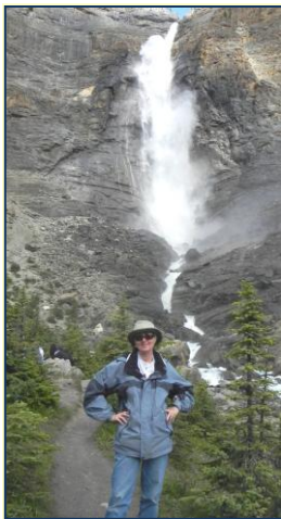
BC's Takakkaw Falls