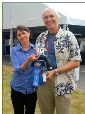
With the official Country Fair cow

it's grown a bit. This year, 800 visitors scrutinized 60 demos covering a plethora of technologies. Even more interestingly, the Intel CTO moved it outdoors "under the bigtop tent" and surrounded it with hay bales, steer roping, popcorn and snowcones, a ring-the-bell-with-the-sledge test of strength, and live music. And if you want live music, who ya gonna call? Yep –