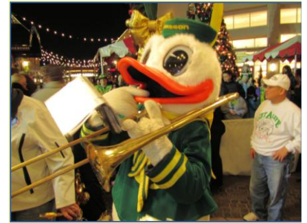
Puddles, the U of O mascot, lends assistance

And yes! It was really cold! Fortunately, we spent most of the time playing in a huge heated tent, though we were out in the cold enough to freeze our poor little fingers almost to our keys. 26 Still, a fine end to the performing year.