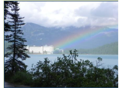
Fairmont Chateau at Lake Louise