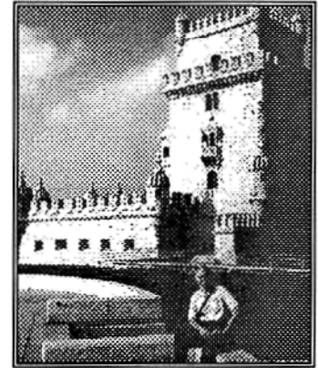
Torre de Belém, Lisbon