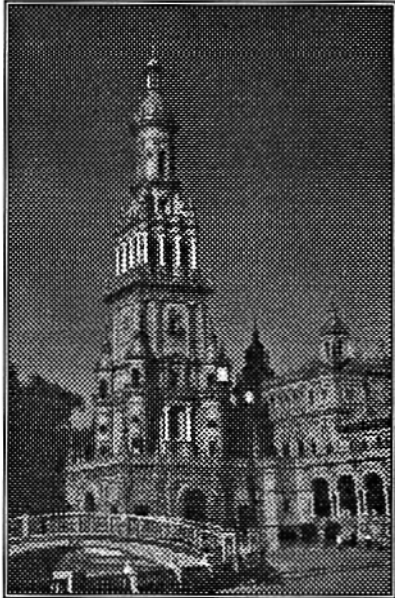
Plaza de España, Seville