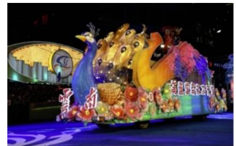
Float from previous Shanghai Grand Parade

help with funding since our members come from a wide range of economic circumstances. 3 Sure, it's unseemly to use your 10-weeks-delayed holiday newsletter to fundraise, but when have we ever been seemly? 4 So please check out the band's website at www.tbgo.org (or see the attachments if you receive the Tattler electronically), imagine yourself as part of the band's adventure, and then write a check to the band travel fund. 5 Donations are tax-deductible, and when you read the recap in next year's Tattler you can think "I helped make that happen."