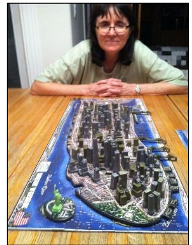
"We built this city ..."