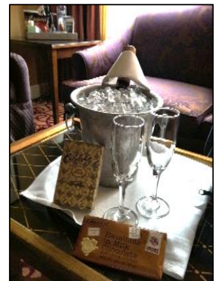
Mmm...does this look yummy & inviting or what? The chocolate was perfect with the wine!

We had a relaxing few days in Friday Harbor 6 and then finished up in Seattle where we