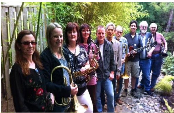
Treble in River City, ready to rock! (That's our backyard)

Our rock 'n' roll band seems to have become the