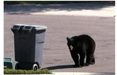
Uh ... I'll bring the trash can in later ...

amazing. Almost as amazing was the amount of baking—after the fact! We think Nick & Sharon must have baked about 47 different kinds of cookies in about a day and a half! OK, maybe there were only about 9 kinds of cookies. But still a crazy amount!