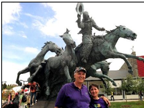
Don't squat with yer spurs on! When in doubt, let yer horse do the thinkin'.

For the second year in a row, TBGO left the country AND was allowed back in! TBGO participated in the Calgary Stampede in July. This was an especially challenging year for the 101st annual event because Calgary was hit with torrential rains and flooding just before the event. Getting things dried out so the Stampede could happen took lots of volunteers, so 'Come Hell or