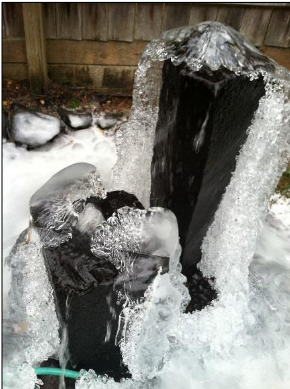
(Not) Breaking the ice: We had quite a cold snap. These are the bubblers in our back yard creating their own ice sculptures. Wow!