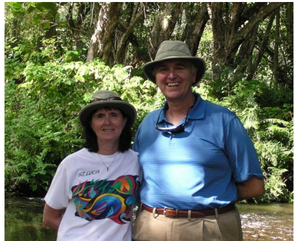
Ta-ta from Waipio Valley