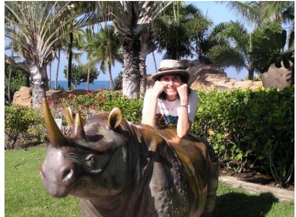
That's, er, a horned toad