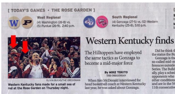
Trust me, that's us!

Portland hosted part of the NCAA basketball tournament this year and both of our alma maters (Purdue and Western Kentucky) not only made the tournament but made it into our regional.