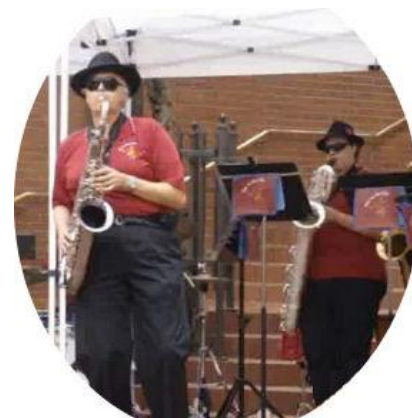
Our newest band

Because you just can't have enough bands, 4 last summer we kicked off a new one. Nine sax players (and one percussionist to keep us in line) played Portland's