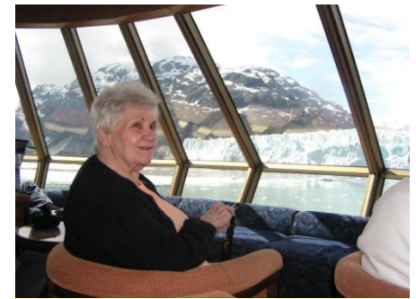
Mom livin' the good life in Glacier Bay National Park